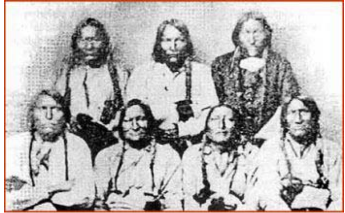
Chiefs of Arapaho, Sioux, Cheyenne and Kiowa Tribe

The primary tribe of Native Americans who inhabited the Front Range when the European settlers arrived was the Arapaho. The name Arapaho may come from the Pawnee word for trader, as the Arapaho were great traders. Lakota Sioux called the Arapaho the Blue Sky People, while other tribes called them the Tattooed People, because Arapaho scratched designs into their skin using yucca leaf needles, then colored the wound with wood ashes to make an indelible tattoo. The Arapaho called themselves Our People or The Bison Path People.