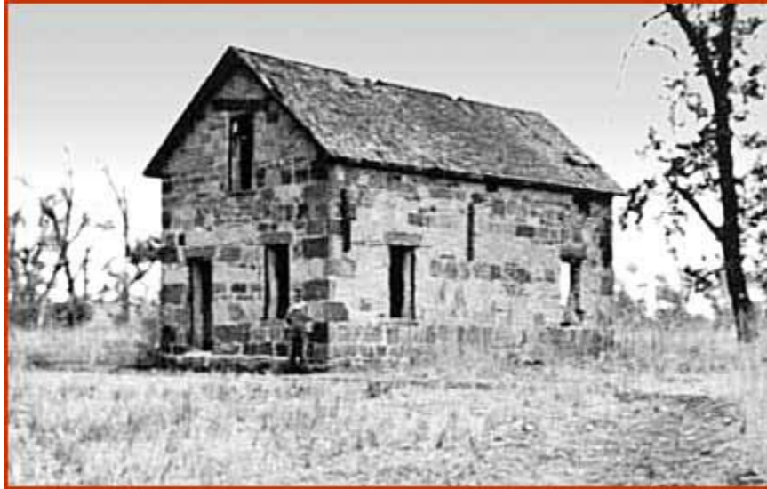
Waneka Stagecoach Station

Before the arrival of the railroads, travel in the West was done on horseback or by wagon. A vital part of the development of the frontier was the network of stage stops that existed along the established trails, including two in the Lafayette area.