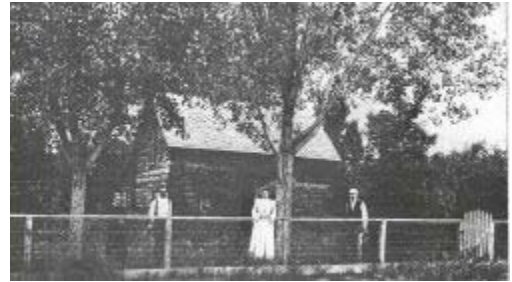
Ewing Family Farmhouse - then