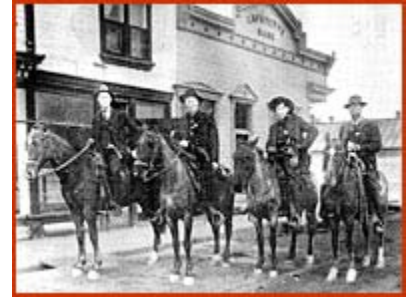
Fuel Co. Riders

Though Josephine Roche did not live in Lafayette, her influence as majority shareholder in Rocky Mountain Fuel Co. was widely felt among the coal mining families in the area. She disapproved of working conditions in her mines and in 1929, two years after the violent strike at the Columbine Mine, she agreed to a 2-year contract with the United Mine Workers that raised wages and instituted more humane working conditions and hours.