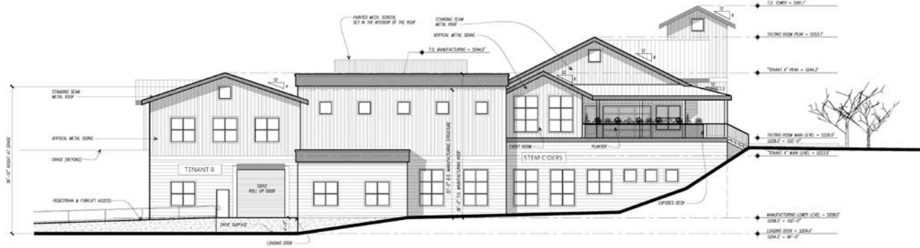
1 | REAR ELEVATION (WEST) SCALE: 1/8" = 1'-0"